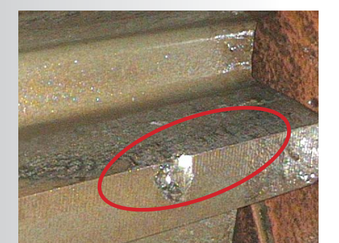
Damage on a gear wheel