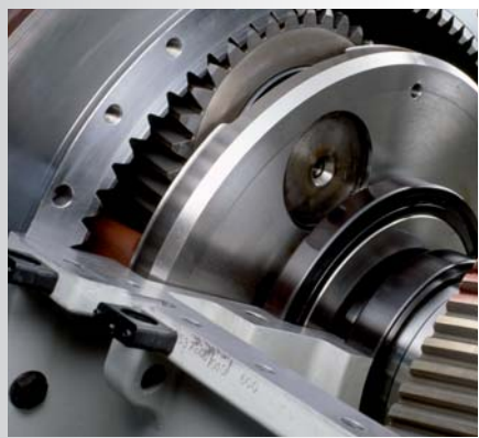
Gearbox for wind power plants