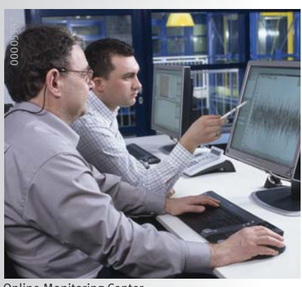
Online Monitoring Center